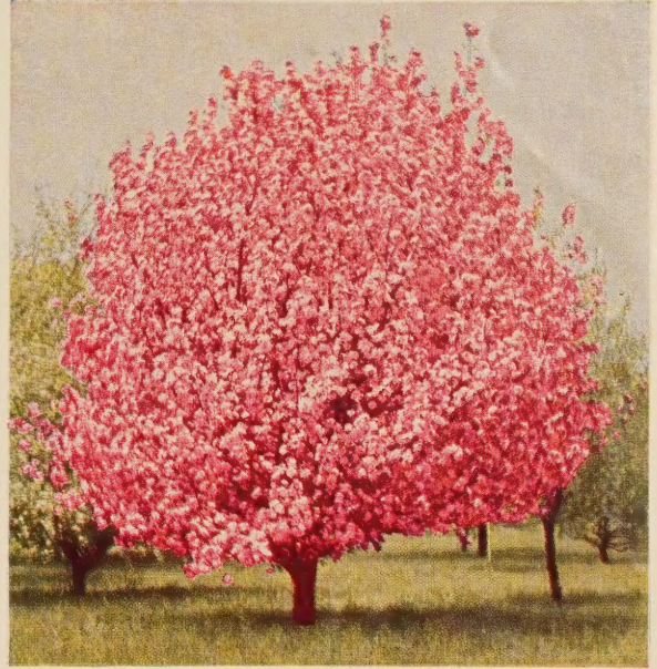
Hopa Flowering Crab—For Shade, Blossoms and Fruit

RUBY TREE ( Prunus pissardi ). Purplish red foliage in spring, retaining its color well throughout summer. Ornamental, bright red fruits. 3-4 ft., $2.25 each. 4-6 ft., $2.75 each.